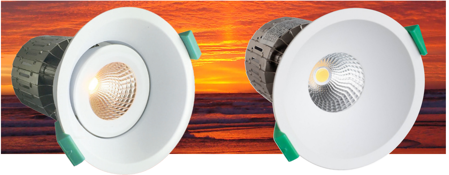
Adjustable LGDSS85A (15W) LGDSS90A (15W)